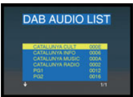
Figure 4: Available audio programs can be easily selected from a list once the multiplex data has been acquired.