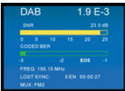
Figure 1: View of the main measurement screen displaying the quality of the signal received on channel 11D, the indication of a possible loss of synchronism and the name of the tuned multiplex.

The PROLINK-4/4C Premium analysers can tune , demodulate and decode terrestrial DAB signals (ETS 300 401):